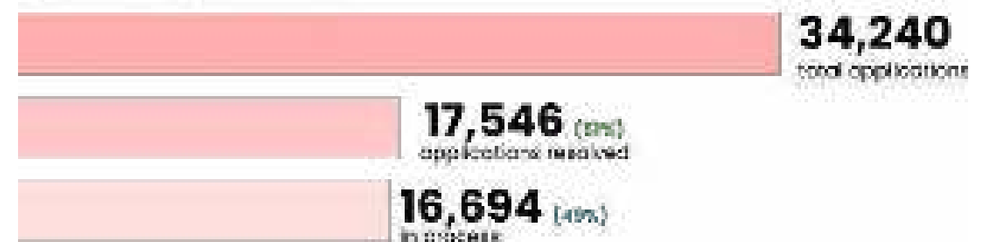
Figure 6ii 28th September, 2022

Jan Darpan is a platform that acts as a citizens portal where rural citizens can register their grievances and submit applications for the realisation of their entitlements. Jan Darpan as a consolidated platform holds the power to reach a vast number of beneficiaries who are living in remote locations or for whom visiting officials with their grievances is expensive, inconvenient and intimidating.